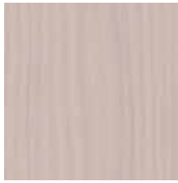
HEMLOCK White Wash