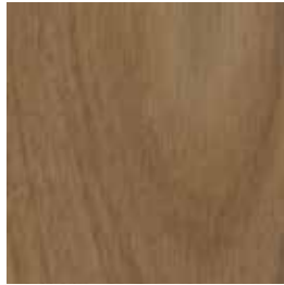
SPOTTED GUM Clear*