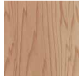
WESTERN RED CEDAR Clear* (3 common shades)