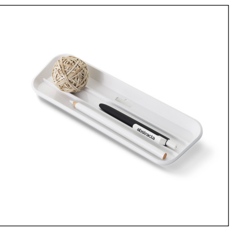
Acrylic Pen Tray